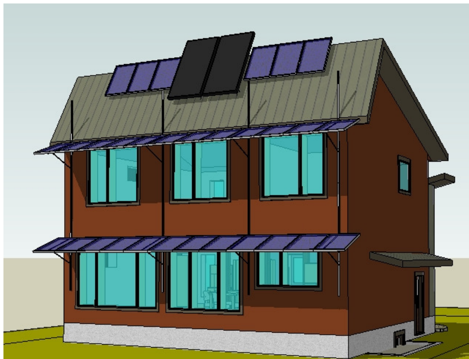
Figure 2. Computer drawing of the south side of the house – with the awning in the summer position