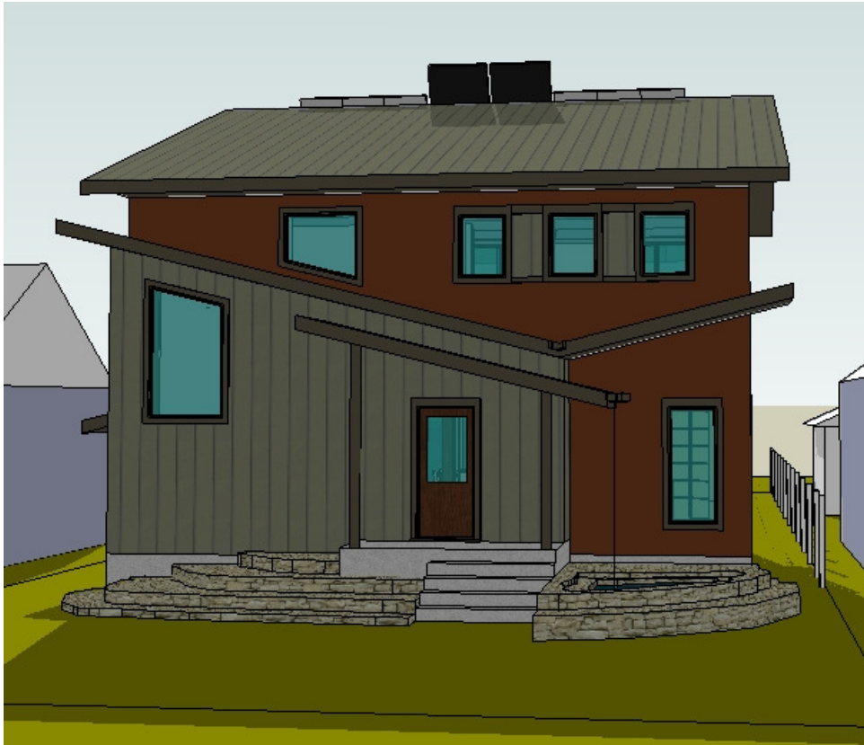
Figure 1. Computer drawing of the front of the house

Note that these are early concepts of the house, which showed a 2-collector active solar thermal domestic water heating system. This system is now not included on the house because the prices of solar electricity have dropped so much.